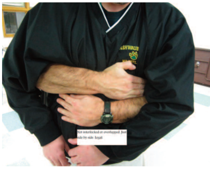
Example #2 - Not interlocked or overlapped. Just side by side. Legal.