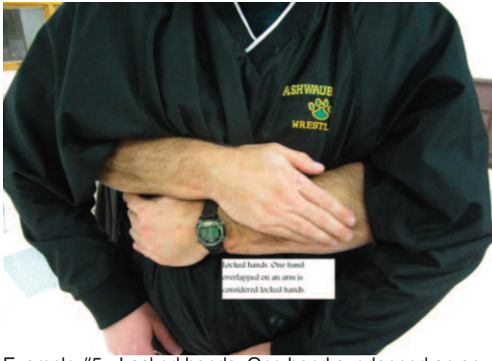
Example #5 - Locked hands. One hand overlapped on an arm is considered locked hands.