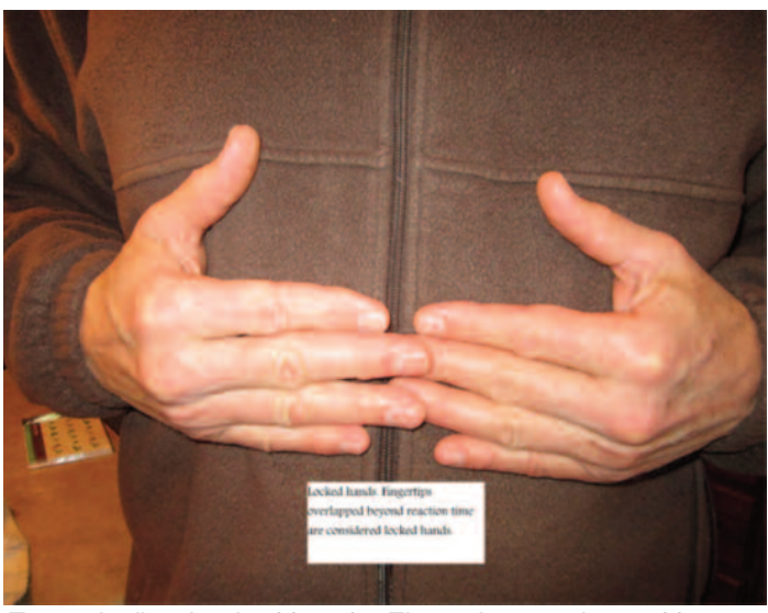
Example #4 - Locked hands. Fingertips overlapped beyond reaction time are considered locked hands.