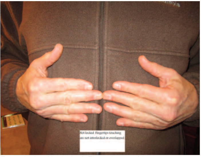
Example #3 - Not locked. Fingertips touching are not interlocked or overlapped.