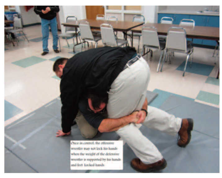
Example #8 - Once in control, the offensive wrestler may not lock his hands when the weight of the defensive wrestler is supported by his hands and feet. Locked hands.