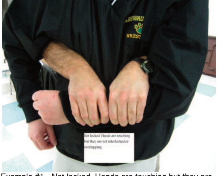
Example #1 - Not locked. Hands are touching but they are not interlocked or overlapping.