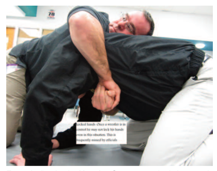
Example #7 - Locked hands. Once a wrestler is in control he may not lock his hands even in this situation. This is frequently missed by officials.