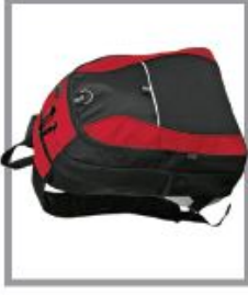
NO BAGS LARGER THAN 8.5" x 11" (INCLUDING BACKPACKS)

Storage facilities are not available for checking prohibited items. Items left at gates will be disposed of accordingly. All items and spectators are subject to search.