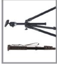
NO TRIPODS, NO MONOPODS