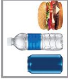
NO FOOD OR BEVERAGES