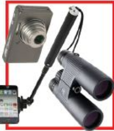
BINOCULARS, CAMERAS, SELFIE STICKS