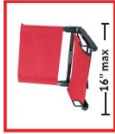
CHAIRBACKS not more than 16" wide