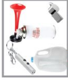
NO NOISEMAKERS NO LASER POINTERS