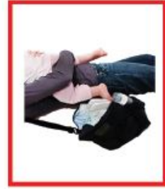
DIAPER BAGS WITH CHILD