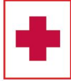
ITEMS RELATED TO A MEDICAL CONDITION