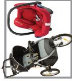
NO STROLLERS, NO BABY CARRIERS