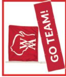
FLAGS, BANNERS, SIGNS (not attached to a stick)