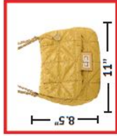
BAGS No larger than 8.5" x 11"