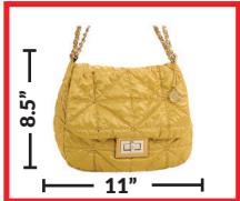
BAGS No larger than 8.5" x 11"