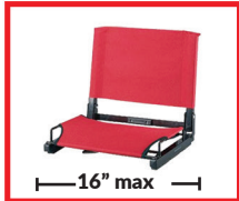
CHAIRBACKS not more than 16" wide