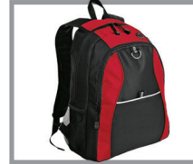
NO BAGS LARGER THAN 8.5" x 11" (INCLUDING BACKPACKS)