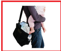
DIAPER BAGS WITH CHILD