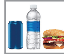
NO FOOD OR BEVERAGES