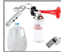
NO NOISEMAKERS NO LASER POINTERS