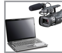
NO LAPTOPS, NO VIDEO RECORDERS