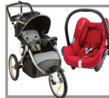
NO STROLLERS, NO BABY CARRIERS