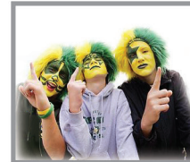
NO FACE PAINT NO BODY PAINT

Images are for personal use only and may not be used for any commercial purposes and may not be re-sold without the express consent of the WIAA.