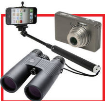
BINOCULARS, CAMERAS, SELFIE STICKS