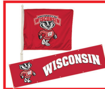
FLAGS, BANNERS, SIGNS (not attached to a stick)