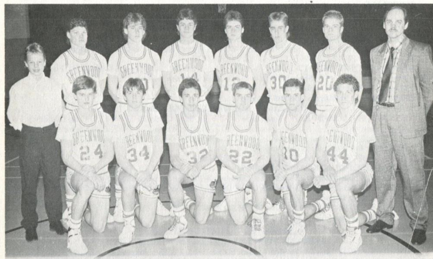
GREENWOOD — BOYS STATE BASKETBALL (C) CHAMPIONS — 1987-88