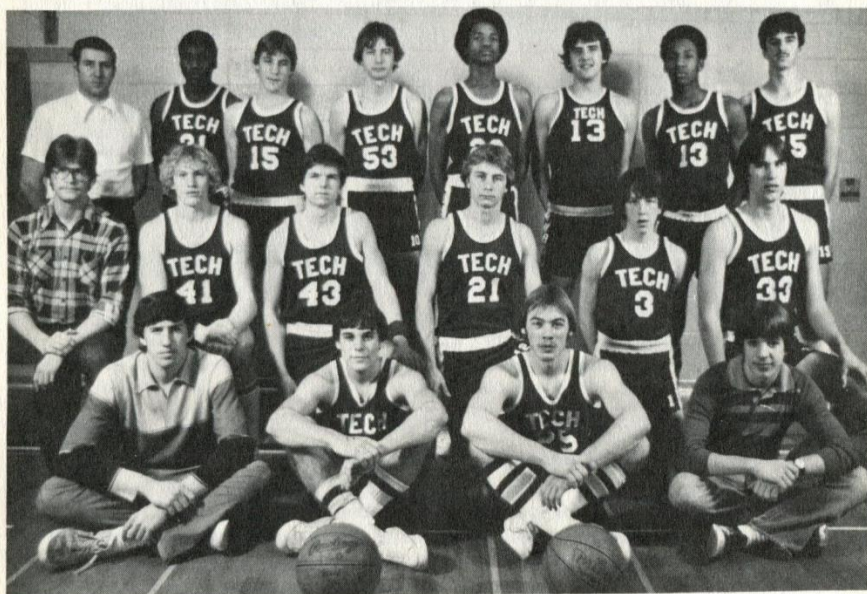
MILWAUKEE TECH — BOYS' BASKETBALL (CLASS A) CHAMPIONS — 1978-79

Niagara survived a third quarter that was almost unbelievable for both teams in winning the Class C