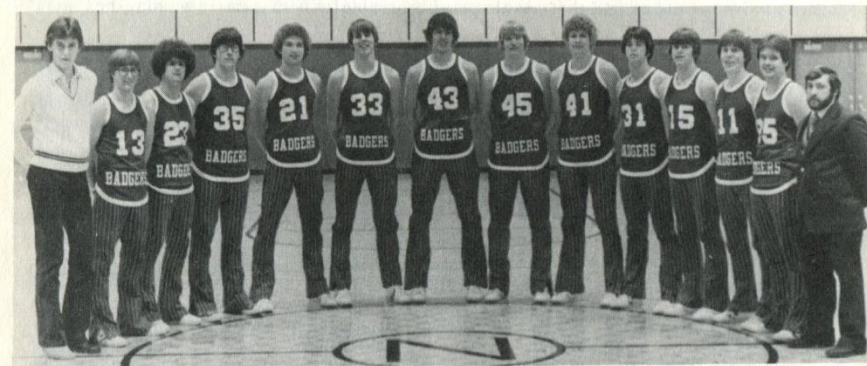
NIAGARA — BOYS' BASKETBALL (CLASS C) CHAMPIONS — 1978-79