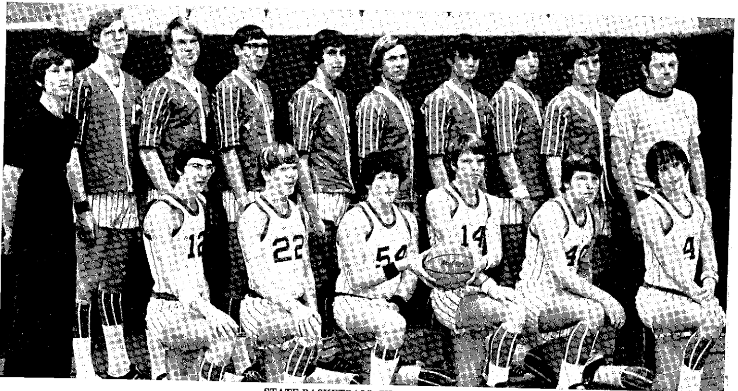
STATE BASKETBALL CHAMPIONS