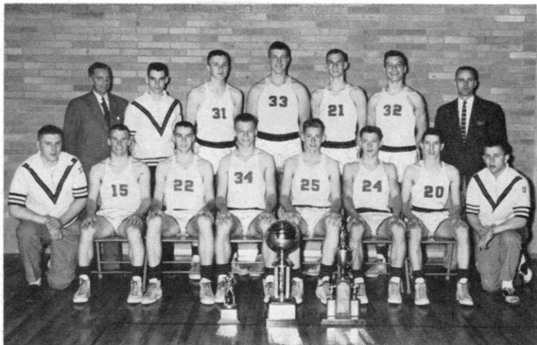
Shawano — Winner State Basketball Tournament