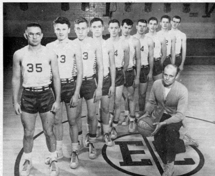
Eau Claire — Runner-Up State Basketball Tournament

St. Croix Falls, prior to the tourney play, had won the St. Croix valley conference crown and was rated fourth in the final Big Sixteen ratings. Including tournament play, the team won 23 games and lost but one...a truly enviable record.