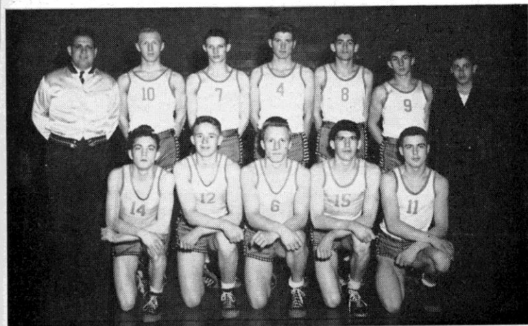
Hurley — Consolation State Basketball Tournament