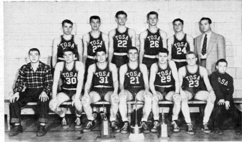
Wauwatosa — Winner State Basketball Tournament