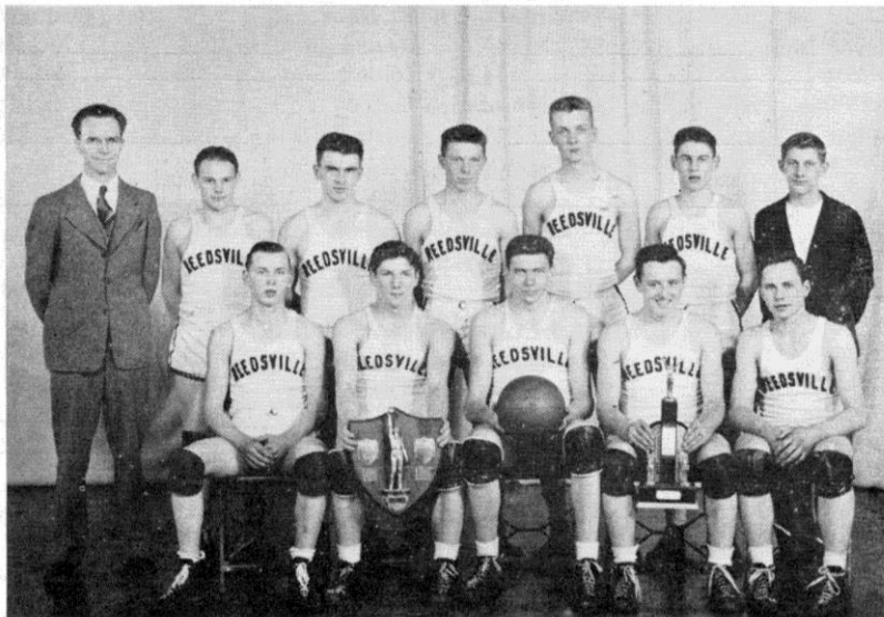
Reedsville — Winner State Basketball Tournament

The story of the 1946 State Tournament will go down in the records as the story of Reedsville. Few gave the boys from the small village a second thought when they qualified for the State Meet. Smiles greeted the prediction—"do not sell Reedsville short". The meet itself produced eight unusually fine teams and all of the games were most interesting. The boys from Reedsville played best when the pressure was on. One remark after the meet by a veteran coach is significant—"We never really found out how good Reedsville was. They produced when needed and then played good enough ball to win."