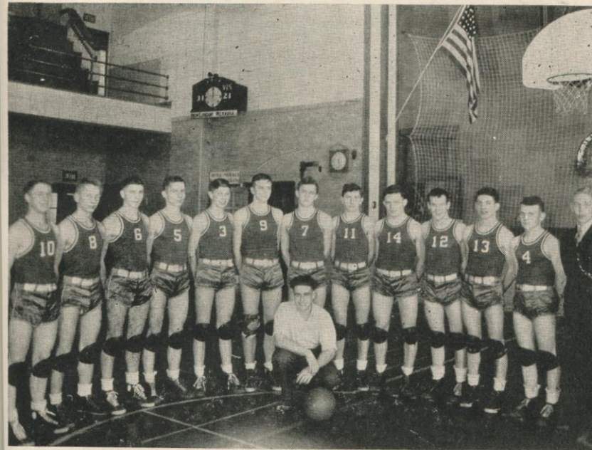
New London—Consolation Winner, State Basketball Tournament