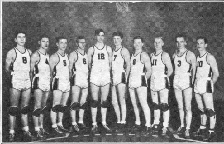
SHAWANO—RUNNER UP, STATE BASKETBALL TOURNAMENT