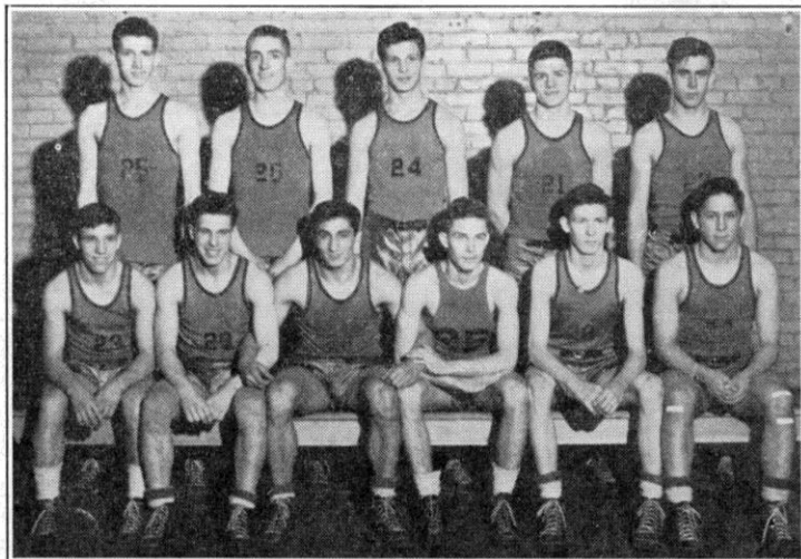
MADISON-CENTRAL—CONSOLATION WINNER STATE BASKETBALL TOURNAMENT