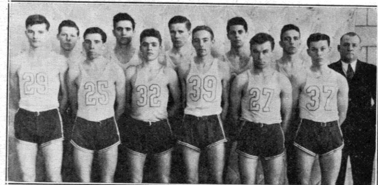
SUPERIOR-CENTRAL—CLASS A CHAMPIONS

Superior-Central repeated in Class A. Port Washington won honors in Class B while to Pardeeville goes the honor of winning the first Class C Championship in a most thrilling finish. The Championship Games in all three classes were closely contested and both losers as well as the winners are worthy of sincere congratulations.