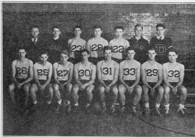
DEPERE—CLASS B CHAMPION