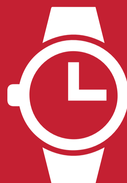
WATCHES & JEWELRY