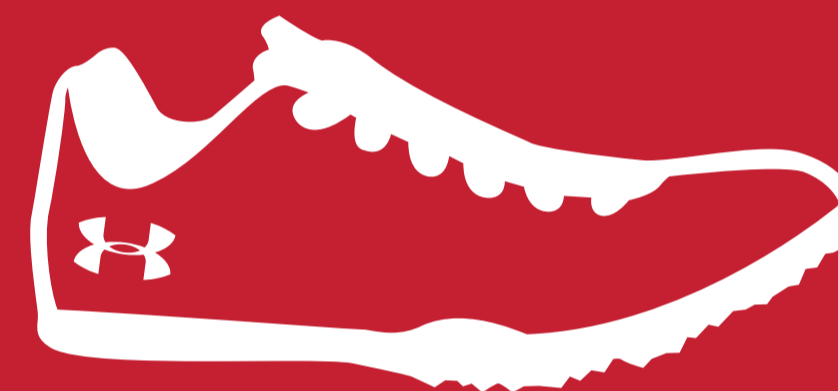
SHOES & JACKETS