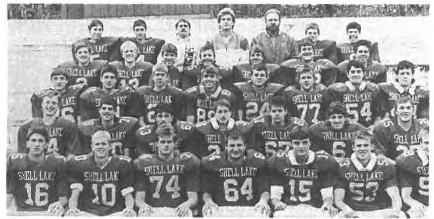
SHELL LAKE - FOOTBALL CHAMPIONS (DIVISION 6) - 1991-92

Clayton 8, Turtle Lake 6; Shell Lake 27, Prairie Farm 6; Niagara 32, Three Lakes 14; Lena 20, Hus Cashton 28, Blair-Taylor 14; Kickapoo 15, Eleva-Strum 14; Highland 12, Seneca 6; Marshall 28, Cambria-Frie