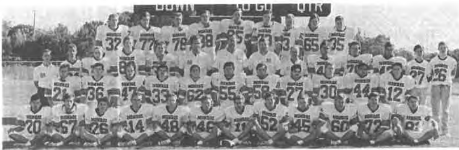
MONROE - FOOTBALL CHAMPIONS (DIVISION 2) - 1991-92