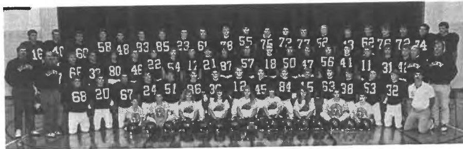
DARLINGTON - FOOTBALL CHAMPIONS (DIVISION 5) - 1991-92