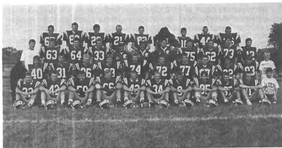
JEFFERSON - FOOTBALL CHAMPIONS (DIVISION 3) - 1991-92