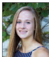
Skylar White River Ridge