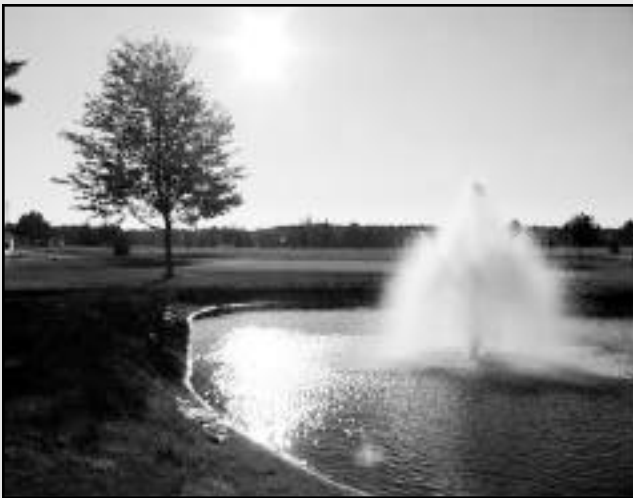
Ridges Golf Course, Wisconsin Rapids Site of the WADA Golf Outing on July 18.

5:45 p.m. – Pig Roast Dinner, followed by awards and prizes.