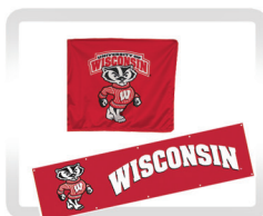
FLAGS, BANNERS, SIGNS (not attached to a stick)