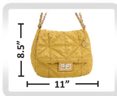
BAGS No larger than 8.5" x 11"