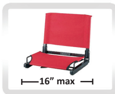
CHAIRBACKS not more than 16" wide