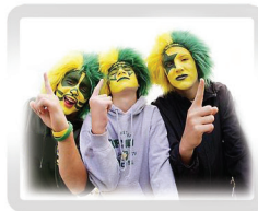
NO FACE PAINT NO BODY PAINT

Images are for personal use only and may not be used for any commercial purposes and may not be re-sold without the express consent of the WIAA.