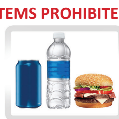
NO FOOD OR BEVERAGES