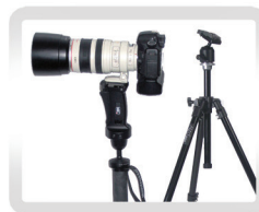
NO CAMERA WITH LENS GREATER THAN 100MM NO MONO/TRIPODS