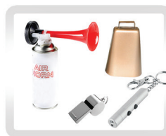
NO NOISEMAKERS NO LASER POINTERS