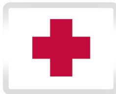
ITEMS RELATED TO A MEDICAL CONDITION