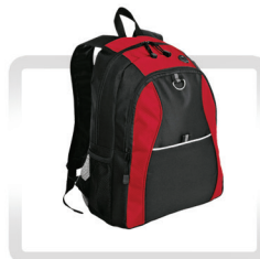
NO BAGS LARGER THAN 8.5" x 11" (INCLUDING BACKPACKS)