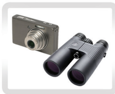
BINOCULARS & CAMERAS (with lens less than 100mm)