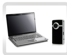
NO LAPTOPS, NO VIDEO RECORDERS